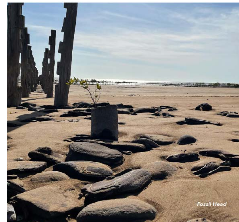
West Daly Regional Council's 2022-23 Regional Plan